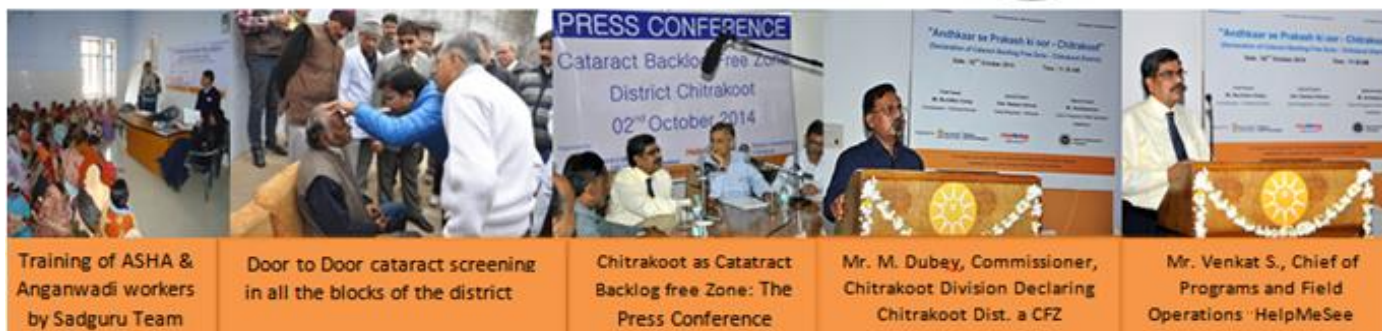
Training of ASHA & Anganwadi workers by Sadguru Team