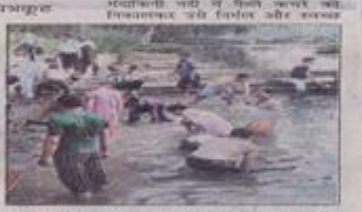
मंदाकिनी नदी में गैरी करने के लिए चित्रकूट जिले में स्वच्छता अभियान की शुरुआत

चित्रकूट जिले में मंदाकिनी नदी के किनारे पर्यावरण को स्वच्छ रखने के लिए एक अभियान शुरू किया गया है। इस अभियान में स्थानीय लोगों का सक्रिय भाग लेना शामिल है।